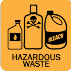
Debris & Hazardous Waste