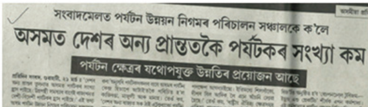
ASOMIYA PRATIDIN, MARCH 22, 2012